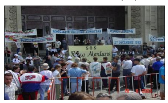
Figure 3. Protest in Bucharest, 2003.