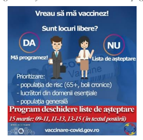
Figure 6. Ad for COVID-19 Vaccination Campaign

Unfortunately, this campaign was not accompanied with the same organizational level. Residents from rural and small-town areas had a scarce access to vaccines- a fact that made Romania a dunce regarding the vaccination rate among European countries