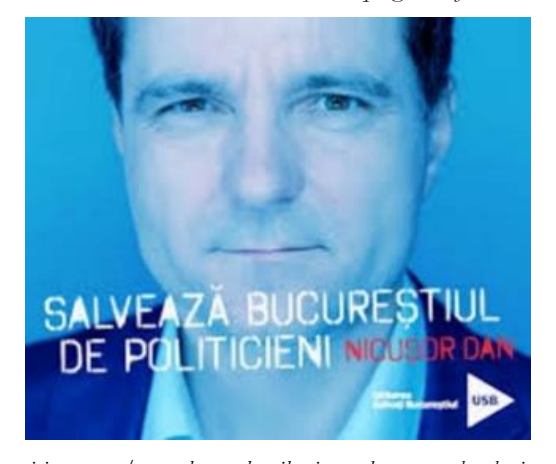
Figure 5. 2016 Bucharest local elections - Campaign Ad for Nicusor Dan

Perhaps the most prominent Romanian political career built with the help of Social Media is the one of Nicusor Dan, the mayor of Bucharest since 2020. Apolitical activist since early 2000, N. D. founds in 2006 the NGO "Uniunea Salvați Bucureștiul" (USB) -Save Bucharest Union. Its aim was to publicly defend historical buildings of Bucharest threatened to be demolished by real estate developers encouraged by a benevolent indifference of local admiration. USB engaged several judiciary battles with some success till 2015 when the NGO changed its status to political party and competed in June 2016 to local elections - Nicusor Dan being candidate for mayor office but eventually losing the elections. Being encouraged by a good result, USB transformed into USR - "Uniunea Salvați Romania" (Save Romania Union) and participated to legislative elections in December 2016 where it gained about 9%. As a result, Nicusor Dan became a member of Romanian Parliament. In 2017, Nicusor Dan decided to quit USR and become independent. He remained very active on civic agenda regarding the administration of Bucharest and received the support of National Liberal Party for his independent candidacy to 2020 mayor office elections, which he eventually won, thus becoming Bucharest's mayor in office.